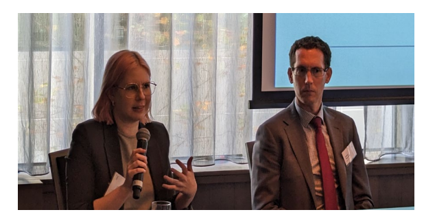
"Definitely valuable – I walked away with new thinking that I had previously discounted".