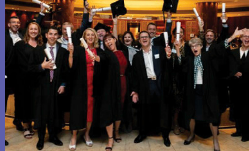
MBS - 2021 Data Analytics, May, students